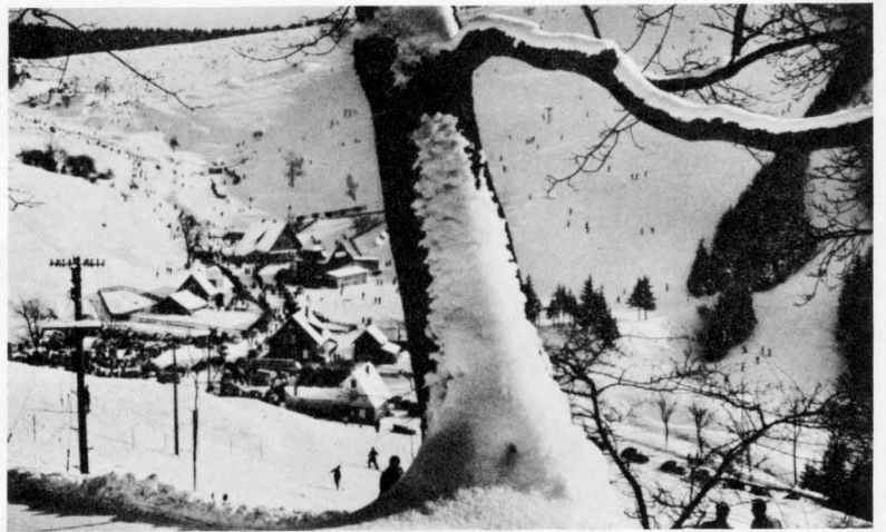
THE SKIING VILLAGE of St. Andreasberg, in the Harz Mountains, as seen during the tourist season.

I soon noticed that many girls were coming to school with arms bandaged from wrist to shoulder and wondered at this strange Berlin disease that often struck on test days. Excuses were interesting: they had to write too much homework; they had to carry too many books; they had inherited weak nerves from parents who had gone through harrowing nights of bombing. These seemed logical reasons and when I became better acquainted I recognized the students' sincerity. They were suffering from painful inflammation of nerves and were probably not even aware of its most obvious cause--pressure exerted by parents and teachers. Failing one subject or getting five (D) in two subjects meant repeating all the following year. A failure the second year resulted in being dropped from school and losing one's chance to attend university. Because there is considerable prestige attached to a university degree in Germany, parents supervise school work most carefully.