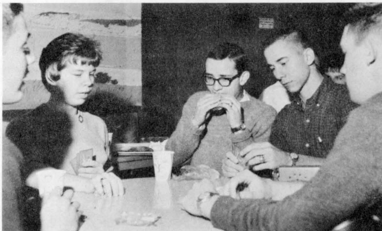
ITS ALWAYS FUN but now its legal. Since the Senate suspended the rule prohibiting card-playing, students now enjoy gaming privileges while they eat.

A higher percentage of deficiencies was reported among students on probation, with negligible difference between the two classes. Close to 75% of the students on probation received deficiencies, with 73. 8% of the sophomores on probation receiving them compared to 75% of the freshmen.